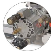
Main motor with leak-oil connection