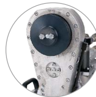
Gear swivel arm with quick-separation flange for easy blade replacement