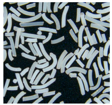
Rod-shaped ceramic grains for high stock removal

The material removal rate (Q'w) was measured and plotted against the observed radial grinding wheel wear: